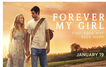
Forever My Girl is in Theaters Now

online podcast called The Prinze and the Wolf that features Freddie