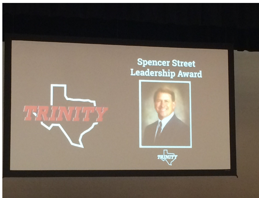
A picture of Spencer Street PC Sp. '86 during the 2017 TU Football Awards Ceremony