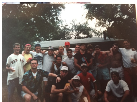
Outside the Lancer House near Trinity around 1991 or so

Have some great old or new Lancer Alumni pictures? Got a great story about what the Lancer Alumni are up to? Send them in!